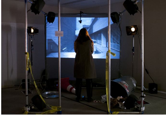
Fig. 1 RIOT installation. This image shows the RIOT Art installation in New York City in 2018. One participant is standing in front of the screen taking part in the experience [35].

individual components. All these factors influenced our choice to use the EmoPy framework and the RIOT project for our sample certification. Key considerations included its potential relevance to the EU AI Act, its open-source nature ensuring transparency, and its suitability for a sample certification. Additionally, the comprehensive system context that the RIOT project provides reinforced this decision, enabling an effective and thorough certification process. It is also important to note that both EmoPy and RIOT were not originally intended for certification by their creators. However, they serve well for this academic exercise, as the focus is on the certification procedure rather than the system’s quality or real-world applicability.